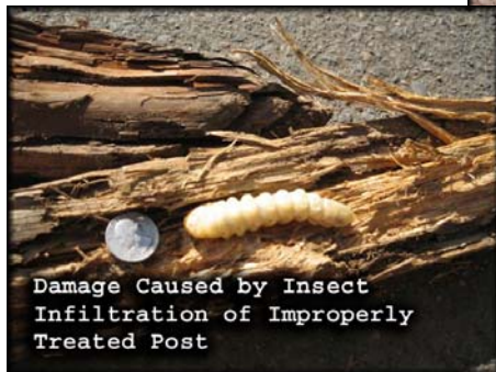
Damage Caused by Insect Infiltration of Improperly Treated Post

An entire local vineyard trellis system was decimated by an infestation of wood boring insects. Damage could have been prevented with properly treated posts.