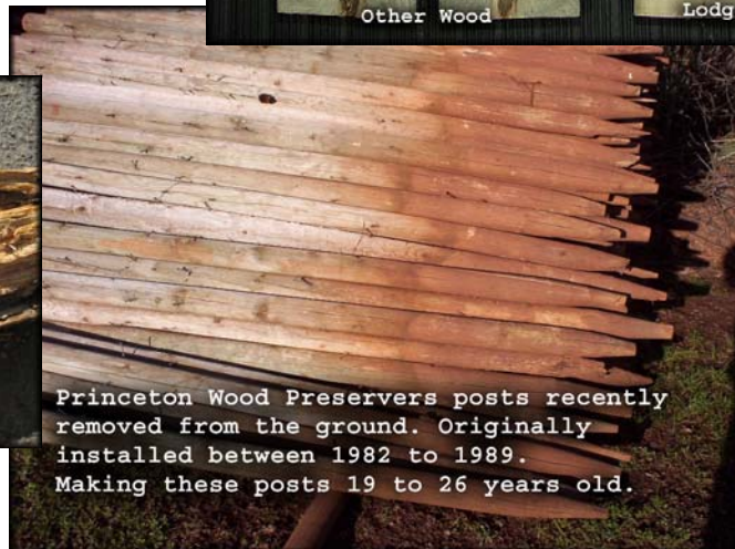
Princeton Wood Preservers posts recently removed from the ground. Originally installed between 1982 to 1989. Making these posts 19 to 26 years old.

An entire local vineyard trellis system was decimated by an infestation of wood boring insects. Damage could have been prevented with properly treated posts.