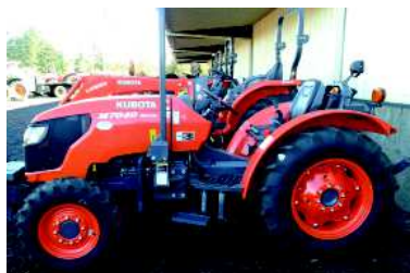
Kubota M7040 Narrow Tractor Rental Return, SN 95394 .99% for 60 months available $32,200