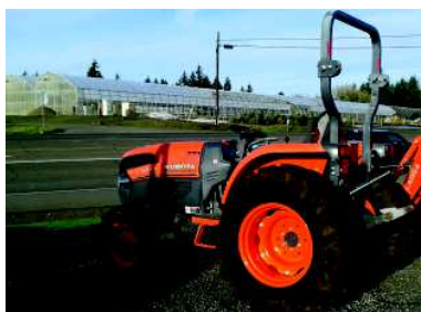
Kubota L3240DT Demo Tractor SN 70353, 32HP, 12.4 x 24 tires, telescopic draft arms, shuttle shift transmission $15,500