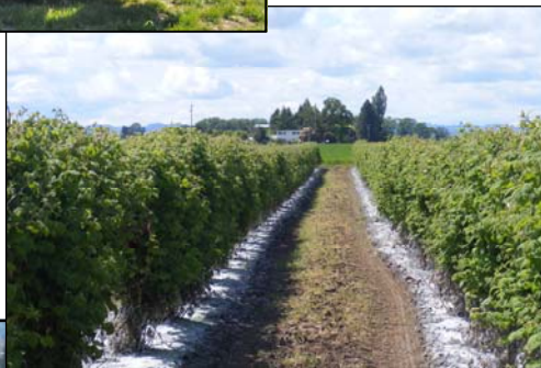
OVS liquid lime application

The limestone is Micronia Ag H2O, 325 mesh particle size.