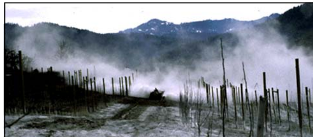
Drift dangers of dry lime application

Compare the targeted application of OVS liquid lime to conventional dry lime application drifts.