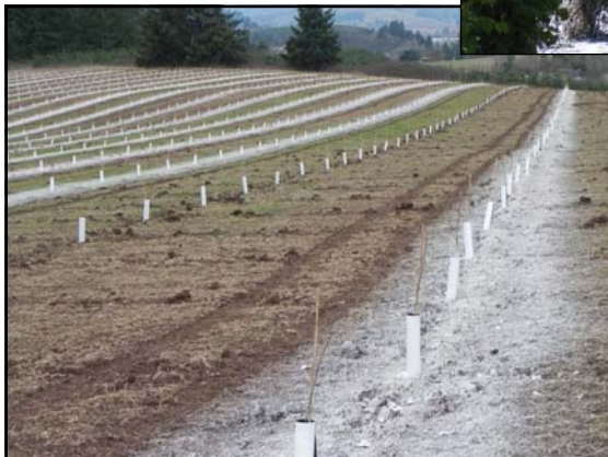
OVS liquid lime application

Compare the targeted application of OVS liquid lime to conventional dry lime application drifts.