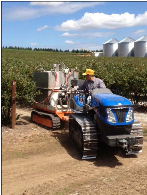
OVS liquid lime application

Soil health impacts fruit quality. Consider calcium's benefits: